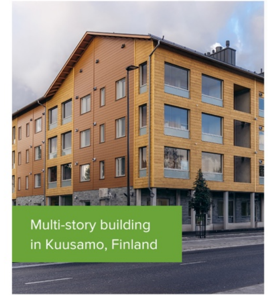
Multi-story building in Kuusamo, Finland

VAARA Stabil™ is the perfect choice for projects of any size. From cozy urban homes to modern holiday retreats or multi-story buildings, VAARA Stabil™ delivers sustainable performance and lasting reliability for architects and builders.